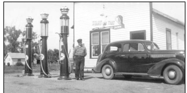
Rudolph Peterson's filling station at Manfred in 1938