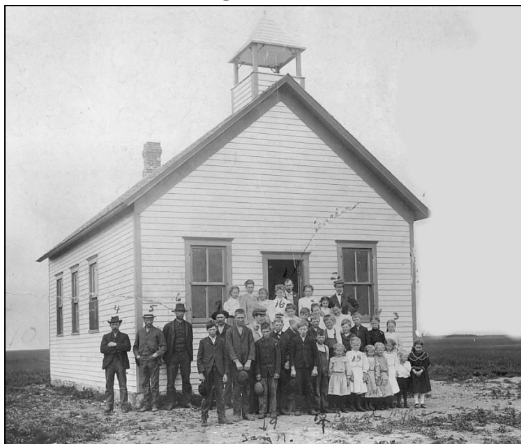
Manfred School No. 3 adjacent to the Rogness farm Photo taken upon completion of this new building in the spring of 1910