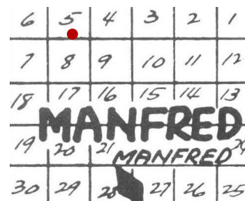
The Rogness Farm and the Rogness School were located on the southwest corner of the SE ¼ of Section 5 in Manfred Township