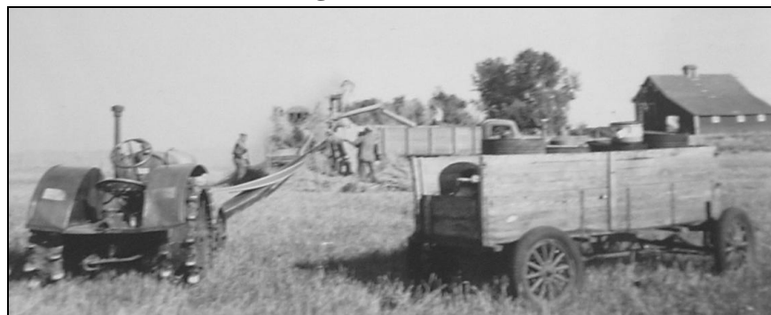
Harvesting on the Nikolai and Everina Rogness Farm The Rogness barn is in view in the background