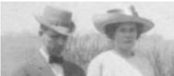
↑ How exciting it must have been for these students and teachers to begin their studies in this brand new school building