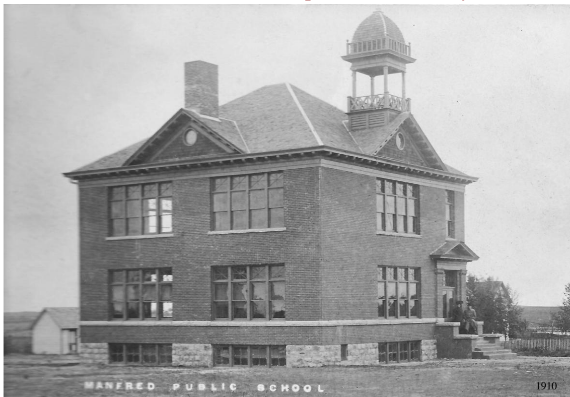
Manfred School soon after completion in 1910

Part 1 – The School Years September 1910 – May 1916